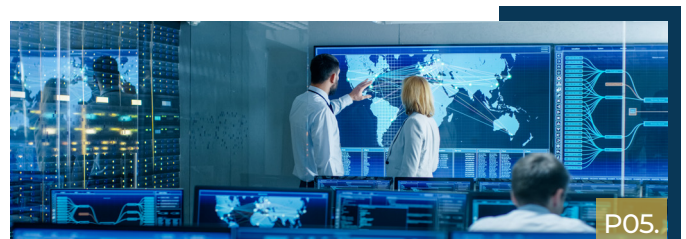
Life Sciences / Medical Devices